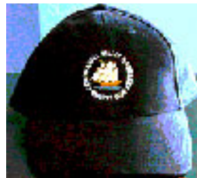
Brushed Cotton Cap